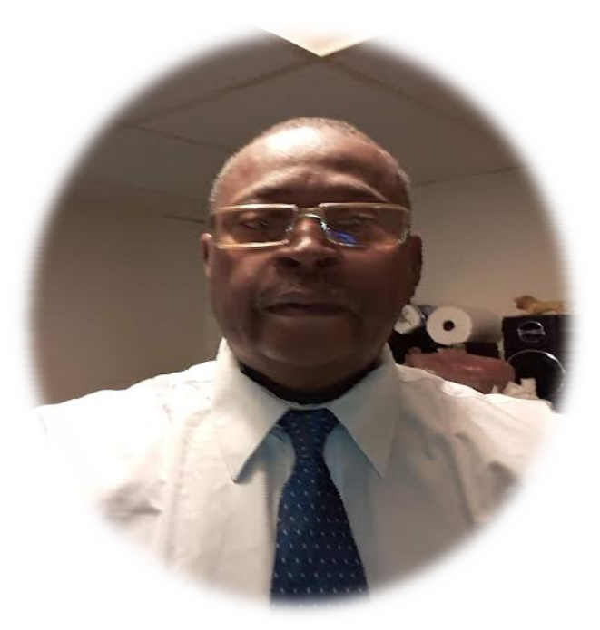
Sunrise September 12, 1956